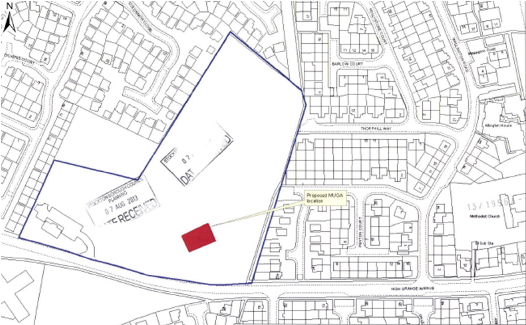
Appendix 1: Site location Plan